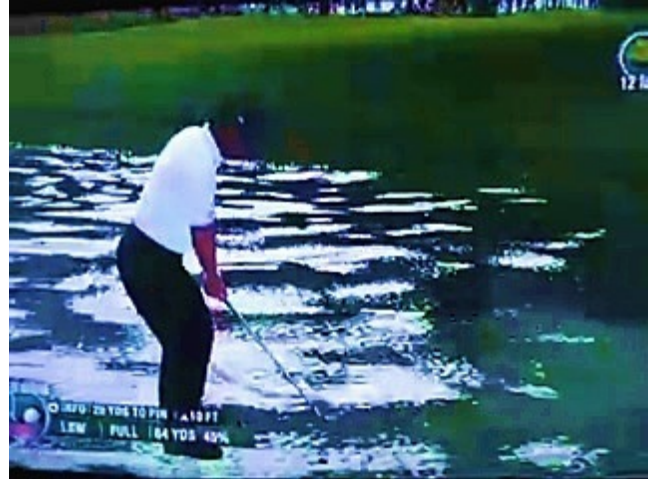
Figure 1: An image of a YouTube video showing the “Jesus Shot,” a failure from Tiger Woods '08 where Tiger Woods is able to walk on water.

YouTube’s bug videos are a rich resource that mix creativity, subversiveness and pure chance. The videos available provide a startling amount of coverage; far more than any single research group could ever hope to expose personally. We became motivated to understand the variety of